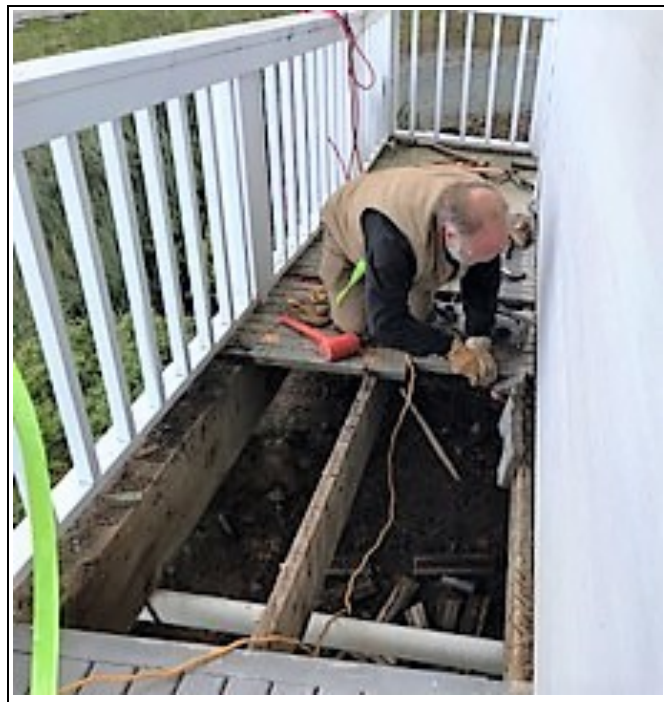
Tom Jackson replacing the upper walkway.