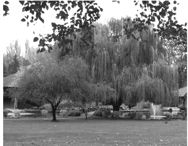
A view from the SMS classroom.

When Seattle Midwifery School (SMS) was founded in 1978, there were no licensed midwives practicing in Washington State. Members of the Fremont Women's Health Collective took the radical initiative to provide a means for aspiring midwives to meet the educational requirements prescribed in a "forgotten" 1917 law. This law authorized the practice of midwifery by care providers who had completed a course of study meeting prescribed requirements. The school these women founded became Seattle Midwifery School.