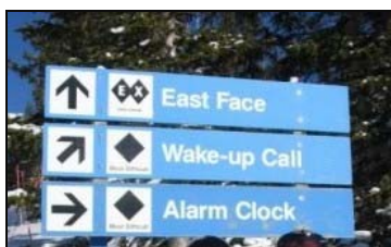
I think someone made a wrong turn going to lunch!

The snow gods were there with us again this January. Those that were at Vail last year remember the great snow we had. Well we didn't have that kind of snow, but it was still pretty great. It snowed the first few days then let up and we saw some of those beautiful blue sky days. There were about 400 people that attended the trip and everyone I talked to had a good time. With the incredible choices of terrain and "champagne powder" the hard core skiers were wore down by the end of the week. Steamboat rolled out the welcome at the Sunday night party with some of the better food we have seen lately. Then they followed it up with an even better spread on Friday night at the awards party. Billy Kidd showed up both nights to entertain and hang with the Texans. Races went off on Thursday with hardly a hitch for almost 200 ski racers. I am also happy to announce that we raised $1000 for the TSC Youth Foundation thru a raffle on Friday night. Steamboat Resort donated lots of great stuff that helped make this happen. I had ten fantastic trip captains that helped make this trip a success. Many thanks go to Sandy Ellison and Cheryl Mann for keeping me on track and somewhat sane during the week. Other officers and committee chairs on the trip were Lisa Spotts, Gary Roth, Linda Raymer and Gene Gilliam. These folks were invaluable in taking care of lots of the "grunt work" during the week. Thanks to all and hope to see you on another trip real soon.