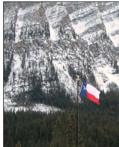
The Texas flag flies in Lake Louise as promised by Sandy Best.