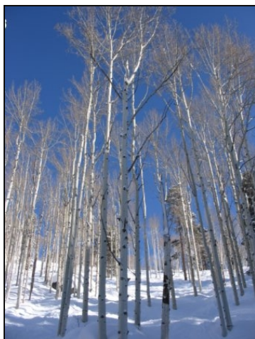
Another beautiful day in paradise - Steamboat, CO.