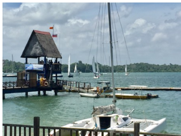
Changi Sailing Club pier. The race start and finish is from the thatched hut on the end of the pier

I have recently returned from a month long visit to Singapore and am now settling in to 'winter mode' back here in the Bay Area, well temporarily as I am off to the UK on the 6th December for three weeks - and it is real winter over there. When in Singapore I usually spend time at the Changi Sailing club located on the east side of the Island which is in close proximity to the Changi International airport. One of my friends is now on the board of Directors and so I have a good conduit into the clubs activities. The club caters for cadet training and youth sailing races as well as