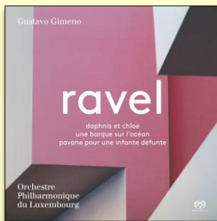
Ravel: Daphnis et Chloe , Pavane , Barque sur l'océan Gustavo Gimeno, Luxembourg Philharmonic Orchestra (Pentatone SACD)

Tanya is temperamentally disposed to make the most of the Andante from Violin Sonata No. 2, in another Siloti transcription that emphasizes its serene progress and steady rhythmic pulse, plus an aria-like melody that soars peacefully over the harmonic accompaniment. Cello Suite No. 2 in D minor is heard in a masterful transcription by Leopold Godowsky that underscores the darker implications that lie in wait for the unsuspecting performer in its Prelude and Sarabande, and even casting its shadow on the usually genial Allemande. Tanya's serene, unhurried approach really brings out the lustre in these dark pearls. Her Minuets I & II are measured and gracious with a steady pulse, and her rippling account of the Gigue is lusty and life-affirming, bringing this suite to a resounding close.