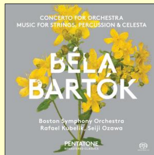
Bartók: Concerto for Orchestra, Music for Strings, Percussion and Celesta – Rafael Kubelik, Seiji Ozawa, Boston Symphony Orchestra (PentaTone SACD)