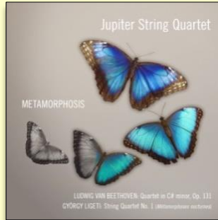
Beethoven: Quartet in C# Minor, Op. 131 + Ligeti: Metamorphoses Jupiter String Quartet (Marquis)

To my knowledge, this is the first time they've recorded Robert Schumann's three String Quartets, Op. 41, though they recorded his Piano Quintet, Op. 44 and Piano Quartet, Op. 47 with pianist Menahem Pressler in 1996 for Deutsche Grammophon, a label for which they were the "flagship" quartet for many years and for whom they