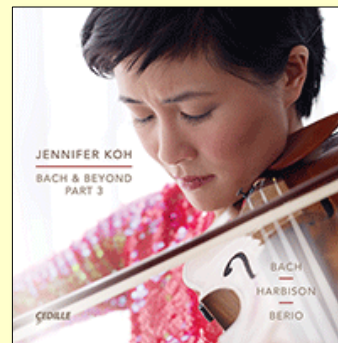
“Bach & Beyond, Part 3”