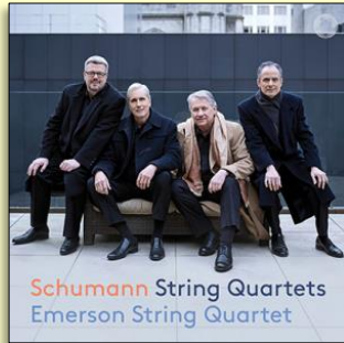
Schumann: The Three Quartets Emerson String Quartet (Pentatone)