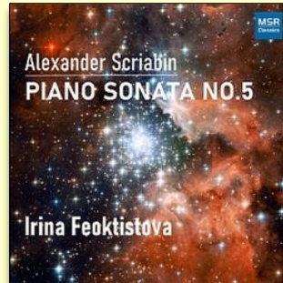
Scriabin: Piano Sonata No. 5 Irina Feoktistova, pianist (MSR Classics)