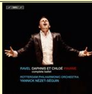
Ravel: Daphnis et Chloé (complete), Pavane for a Dead Princess Yannick Nézet-Séguin, Rotterdam Phil. Orch. (Bis hybrid SACD, DSD)

Des canyons aux étoiles (From the Canyons to the Stars) was commissioned by the American philanthropist Alice Tully as part of the U.S. Bicentennial Celebration. Perhaps at a suggestion from his patron, Messiaen visited Utah and was struck by the natural wonders of a state that yields to none in that department. They include the towering red-orange spires of Bryce