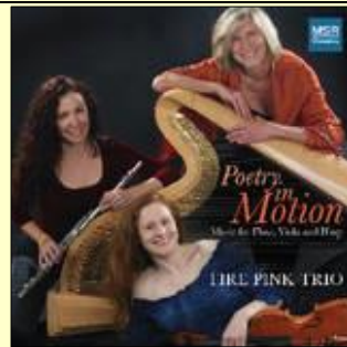
"Poetry in Motion," Music for Flute, Viola, and Harp performed by the Fire Pink Trio (MSR Classics)

It is well worth your listening. The fantasies, variations and potpurri by contemporary guitar and flute virtuosos on operatic music by Bizet, Rossini, Mozart, Verdi, and others make you realize how lucky those hand-kissing salon habitués were. With utterly breathtaking brilliance