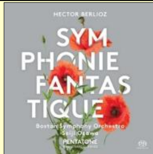
Berlioz: Symphonie Fantastique Seiji Ozawa, Boston Symphony Orchestra (Pentatone hybrid SACD)