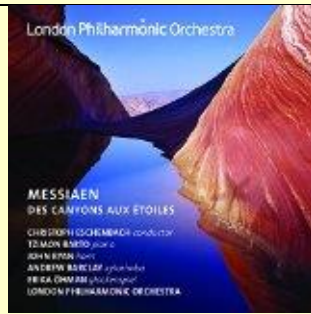
Messiaen: Des Canyons aux étoiles Christoph Eschenbach, London Philharmonic Orchestra (LPO) 2-CD

The 22 tracks include such Lady Day favorites as "God Bless the Child," "I Don't Stand a Ghost of a Chance with You," "I Wished on the Moon," "What a Little Moonlight Can Do," "The End of a Love Affair," "Strange Fruit," "Good Morning Heartache," and "In My Solitude."