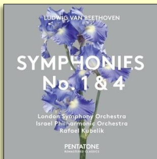
Beethoven: Symphonies 1 & 4 Rafael Kubelik conducts London Symphony, Israel Philharmonic Orchestras (Pentatone SACD)

In the following recent releases of Beethoven symphonies under the baton of renowned Czech conductor Rafael Kubelik (1914-1996), the Remastered Classics series reaches a new high standard. In terms of vibrant performances captured in a remarkable soundstage perspective. These recordings, made with the preeminent orchestras of two continents, may well serve as a standard for other Beethoven projects to aim at.