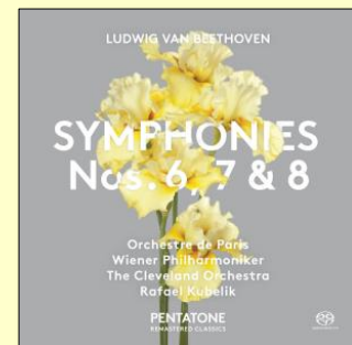
Beethoven: Symphonies 6, 7, 8 Rafael Kubelik conducts Orchestre de Paris, Wiener Philharmoniker, Cleveland Orchestra (Pentatone SACD)

Beethoven's well-known propensity for joking was readily apparent to the Viennese audience who heard the 5 April, 1803 premiere of his Symphony No. 2 in D, Op. 36. The side-slapping dance imitated by the oboe and bassoon quartet in the scherzo movement and a motif suggesting hiccoughing in the finale were evidence of that. But it has its serious matter, as well. In its major-