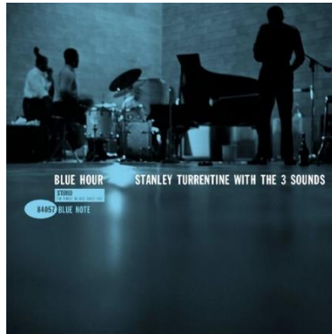
Stanley Turrentine With The Three Sounds – Blue Hour Music Matters Jazz

In the hands of Stanley Turrentine , the tenor saxophone was an instrument of soulful creativity and immense power. From his 1960 Blue Note debut, Look Out (BLP 4039/BST 84039) through his biggest hit for CTI Records, Sugar (CTI 6005) in 1971, Turrentine's credentials were second to none as a giant in the genres of Hard-Bop, Modal and Soul-Jazz. The subject of this discussion places the tenor man in the company of Gene Harris on piano; Andrew Simpkins on bass and Bill Dowdy on drums who were collectively known as The Three Sounds for a program of the Blues. Blue Hour (BLP 4057/BST 84057), originally released in 1961 is the second of only two records where The Three Sounds would back a saxophonist. The first LP was 1959's LD + 3 (BLP 4012/BST 84012) with alto saxophonist Lou Donaldson . My copy used in this report is the 2015 Music Matters 33 1/3 Stereo reissue (MMBST-84057). The 1930 song, I Want A Little Girl written by Murray Mencher and Billy Moll leads off the first side. This infrequently heard ballad opens with an angelic introduction by the trio, exhibiting Harris' attentiveness to the lyric and melody. Stanley joins in for the theme with a quiet sincerity in his approach, then delivers a graceful performance which captures the essence of this standard on the initial solo. Harris' interlude is brief, but lovely and the closing by the quartet is especially beautiful.