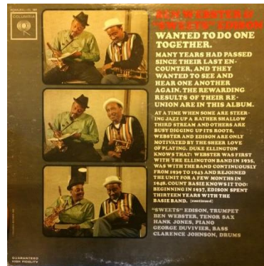
Ben Webster and "Sweets" Edison – Wanted To Do One Together Columbia Records

Benjamin Francis Webster (1909-1973) and Harry "Sweets" Edison (1915-1999) were two of the most respected and beloved musicians that Jazz ever produced. Ben Webster created a style on the tenor sax that's still one of the most personal and immediately identifiable on record. He was affectionately known as "The Brute" for his sometimes coarse, harsh or rough sound by his Ellington bandmates. Webster was capable of expressing intense feeling on any ballad or standard which always garnered amazement from a listener on an album or standing ovations whenever he performed live. Ben was also an essential part of Duke Ellington's orchestra in 1935 and worked with the orchestra continuously from 1939 to 1943,