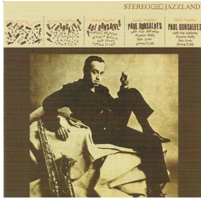
Paul Gonsalves – Gettin' Together Jazzland Original Jazz Classics