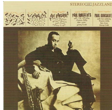
Paul Gonsalves – Gettin' Together

Arthur Stewart Farmer, In A Sentimental Mood, It Don't Mean A Thing, The Star-Crossed Lovers, Such Sweet Thunder, The Brown Skin Girl In The Calico, Ella at Duke's Place, Lush Life, Love You Madly, Duke's Big 4 – Source: Wikipedia.com