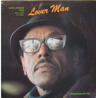
The Duke Jordan Trio – Lover Man

In this installment from the library, I've chosen an album by pianist Duke Jordan (1922-2006) and his trio which was recorded in 1975, but not released until four years later in 1979. This underrated, extremely gifted musician has impressed me ever since I first heard his only album for Blue Note as a leader, 1960's Flight to Jordan (BLP 4046/BST 84046) and his earlier 1975 SteepleChase LP, Two Loves (SCS-1024). Lover Man (SteepleChase SCS 1127) is the companion to Duke's Delight (SCS 1046) which was also recorded at the same session, featuring the top-notch rhythm section of Sam Jones (1924-1981) on bass and Al Foster on drums, plus Richard Williams (1931-1985) on trumpet and Charlie Rouse (1924-1988) on tenor sax. My copy used for this report is the original Danish pressing and the LP opens with an uptempo treatment of Dig by Miles Davis (1926-1991). This jazz standard starts with a hip melody treatment, then Jordan makes every note count with a lively effervescence on the song's only solo that is vigorously tasteful to the last note. Up next is Dancer's Call , the first of two originals by Jordan, the trio introduces the song at a medium tempo for the theme statement. The composer opens with an intriguing improvisation, followed by Jones who sculpts the next statement with verses of articulate subtlety at a smooth pace. Foster steps into the spotlight last offering his own improvisatory stamina in a provocative series of exchanges with Jordan's