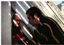
Art Farmer & Jim Hall – Big Blues ORG Music

This first choice from the library to begin September I acquired after hearing a selection on SiriusXM's Real Jazz channel. The album is titled Big Blues (CTI Records CTI 7083), released in 1979 and the two men co-leading this enjoyable date are Art Farmer on flugelhorn and Jim Hall on guitar. Rounding out the ensemble are Mike Mainieri on vibes, Mike Moore on bass, and Steve Gadd on drums. My copy used in this report is the 2017 ORG Music Stereo Audiophile reissue (ORGM-2019). The song that initially sparked my interest leads off the first side, Benny Golson's 1956 contemporary jazz classic, Whisper Not! It's one of his most recorded compositions and also became a beloved vocal after Leonard Feather added lyrics in 1962. The quintet jointly creates a mellow melody with a blues beat to begin the song. Jim makes his guitar sing first with a relaxed casualness and steady rhythm. Art gets into an infectious laid-back groove next moving upward with bright chops and impeccable prowess. Mike takes over for the finale with an astonishing drive and intensity preceding the reprise and gentle coda.