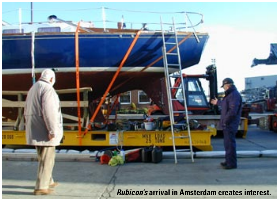
Rubicon's arrival in Amsterdam creates interest.

crane lifted her off the trailer and carefully launched her into the water.