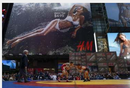
Freeze Frame 2014-05-08