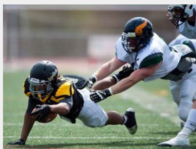
Pennsylvania Scholastic Football Coaches Association East-West Game 2014-05-04