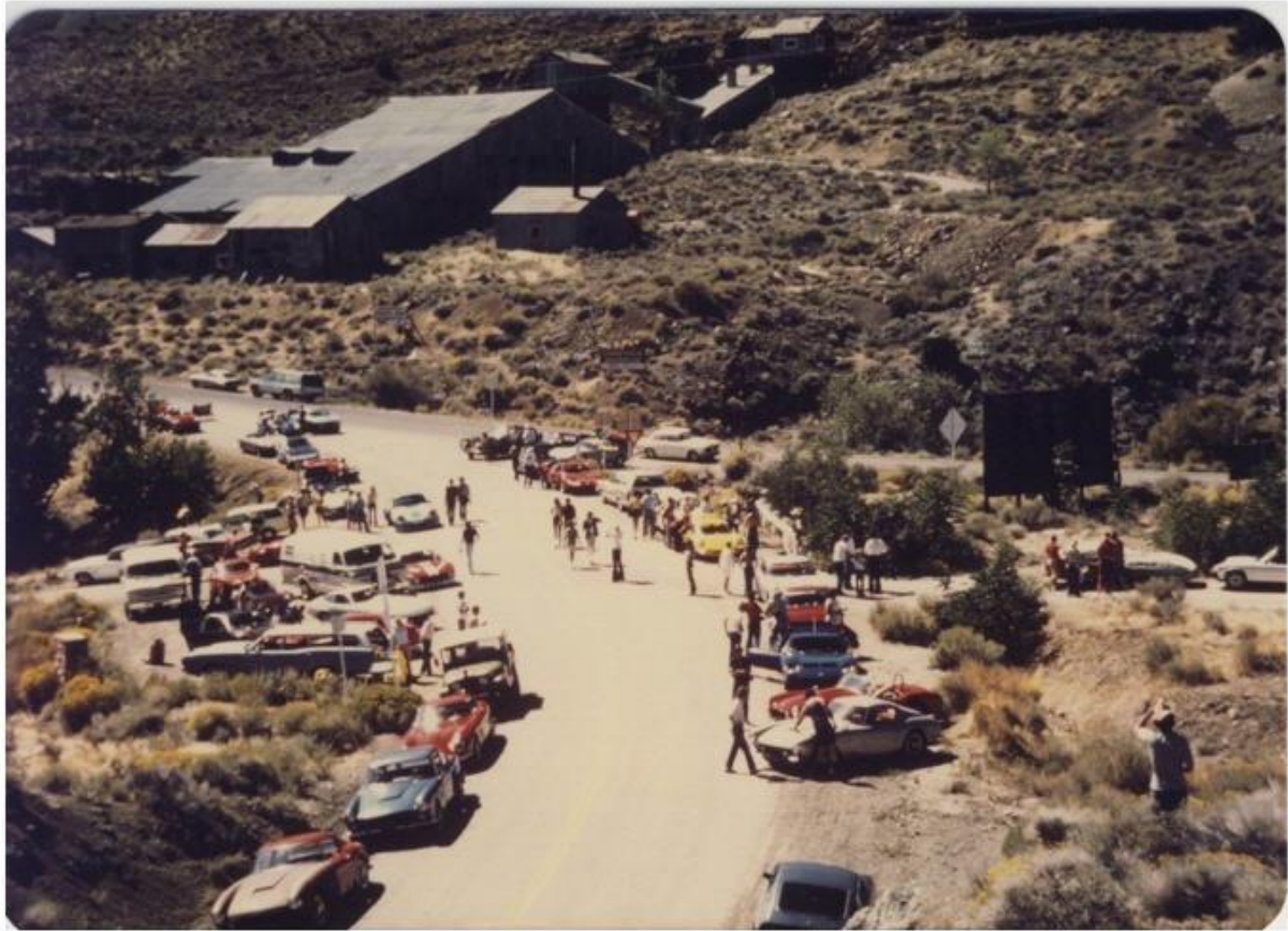
Images from the FCA-PR Glen Snider Memorial Album and the 1975 album