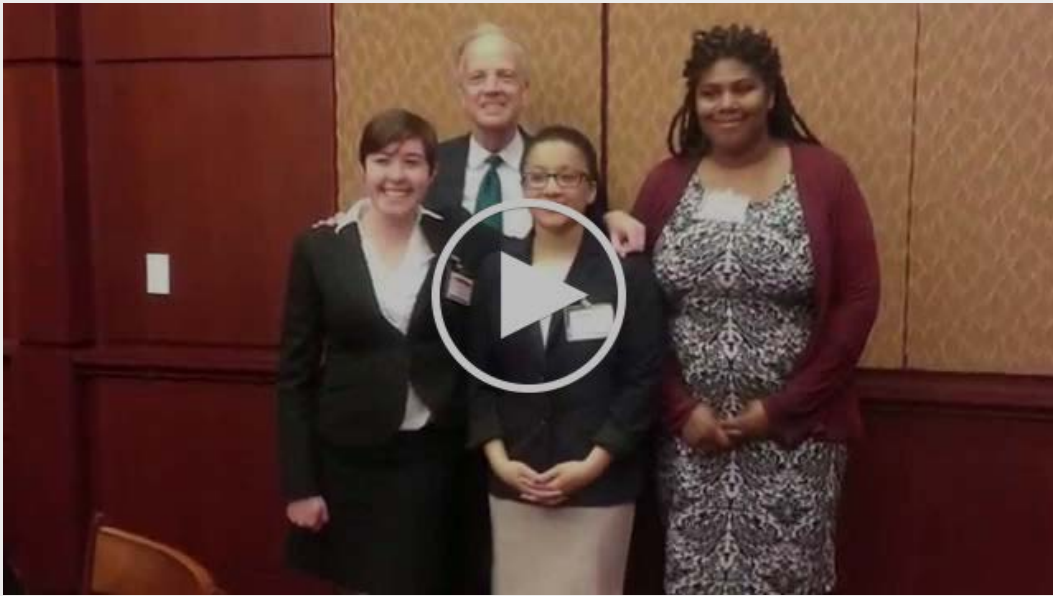
Policy Seminar 2015 - Fist bumps, Vines and Selfies Galore!