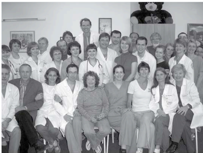
The Heart to Heart-Tomsk team says "Pirogi!" after a mission that included several successful "firsts" for our Russian colleagues.