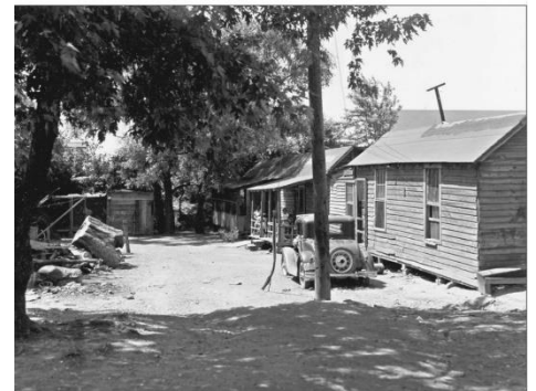
Homes of Black workers in Bethesda