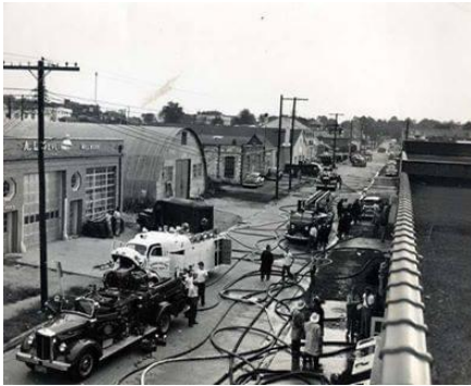
Bethesda Avenue, 1951

Another surprise was that a major reason Bethesda become a successful retail center was that the developer of residential neighborhoods along Connecticut Avenue, from Chevy Chase Circle northward, banned commercial development. Nearby Bethesda welcomed it with open arms.