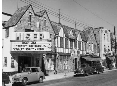
Hiser Theater, 1940s