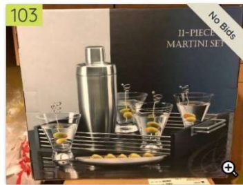
Martini Cocktail Set