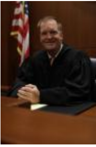
Drew Crompton (Rep) Judge