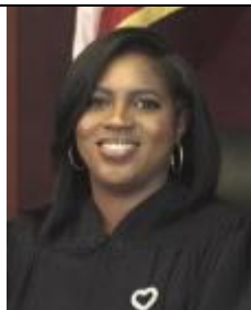
Timika Lane (Dem) Judge - Court of Common Pleas