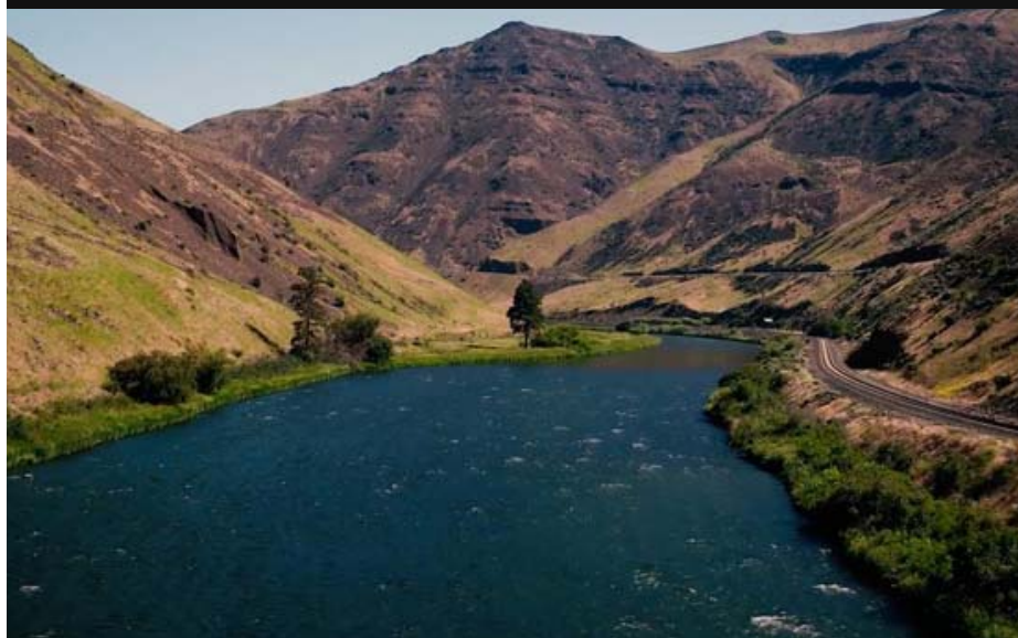
Yakima River Valley