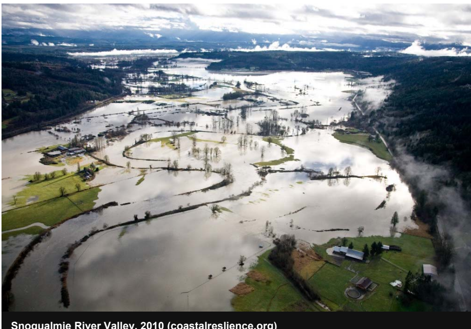
Snoqualmie River Valley, 2010