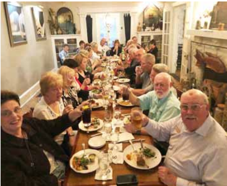
Feasting in our private room at Pices Rising Restaurant in Mt Dora. A good meal was had by all; prior to the live play.