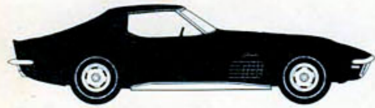
'71 Stingray Coupe