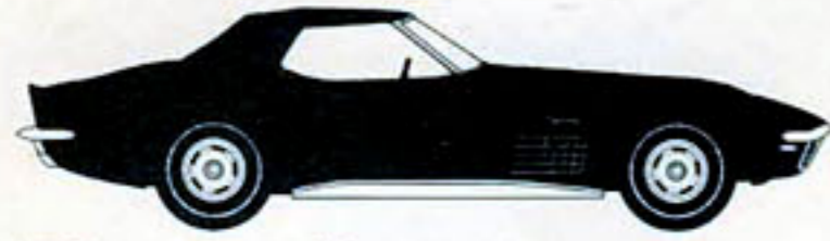
'71 Stingray Convertible

(The one on the reverse side is the Stingray Coupe.)