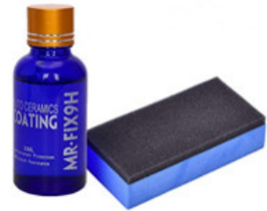
Aneil High Gloss Ceramic Car Coating Kit ★★★★★