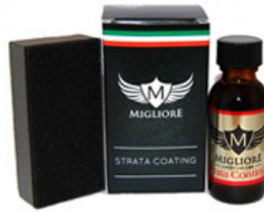
Migliore Strata Coating ★★★★★