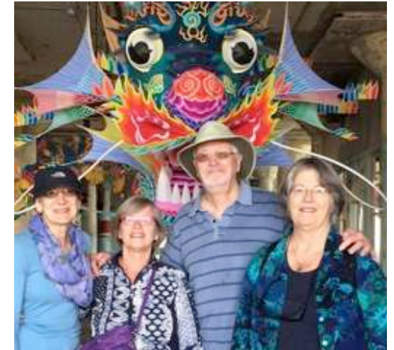
Members enjoy excursions in the larger community to social and cultural events.

Crafting groups, exercise groups, monthly potlucks, special interest groups, outings and presentations on a variety of current topics. See our website.