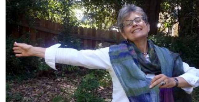
the joy of living