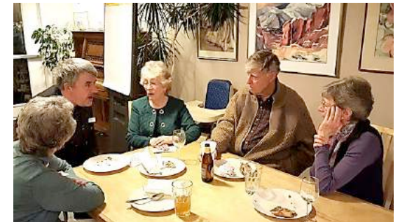
Volunteers enjoy catching up at a special Pizza and Beer Night in their honor.