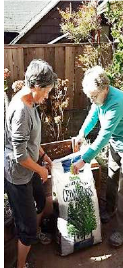
Volunteers share their tech skills while others help a member with a garden project.

Volunteers provide members with a range of support and transportation services.