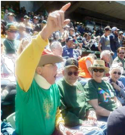
NOV fans attend an A's game