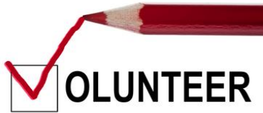
This Photo by Unknown Author is