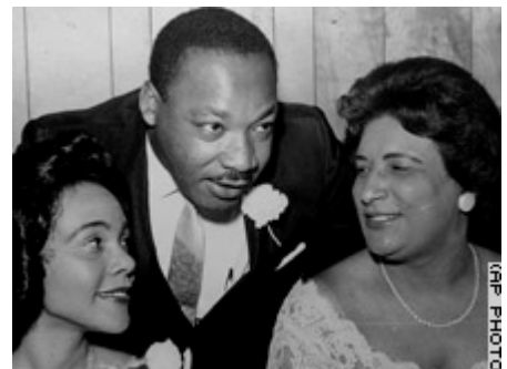
Dr. Martin Luther King Jr. chats with his wife, Coretta, and his lawyer Constance Baker Motley in 1965.