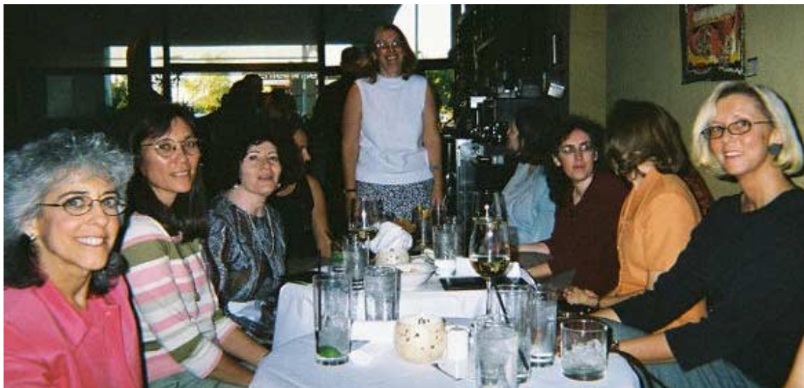
AWLA members enjoy drinks and lively conversation at the first monthly networking happy hour.