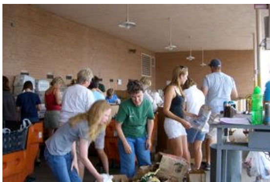
Food Bank Event Volunteers

Congratulations to all members of the AWLA who helped with this service project both with donations and labor.