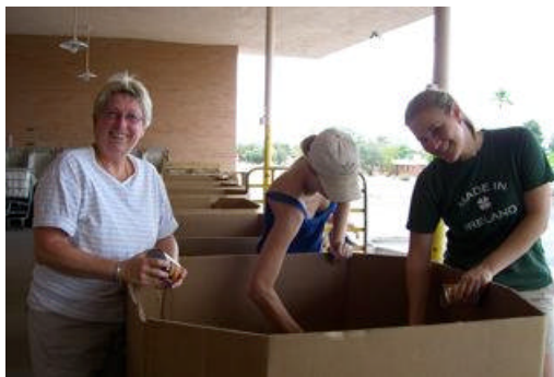
Food Bank Event Volunteers