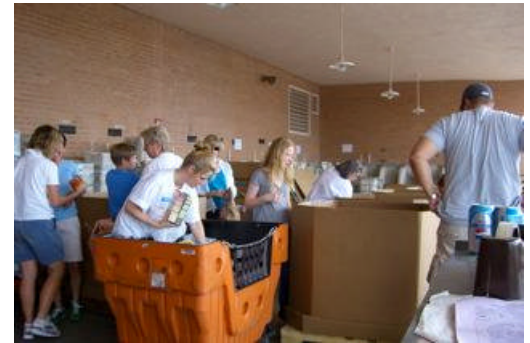
Food Bank Event Volunteers

The AWLA participated in the nationwide food drive for the Community Food Bank on May 12, 2007 as this year's community service project. This annual event was completed with the support of the Post Office, whose employees picked up the food donations for the Food Bank. This event is the largest food drive for the Community Food Bank each year and allows this agency to deliver over 10,000 food boxes to families in need in the Tucson area. The community Food Bank is especially grateful for food donations in the summer as there are many families with increased food needs with the children home from school for the summer.