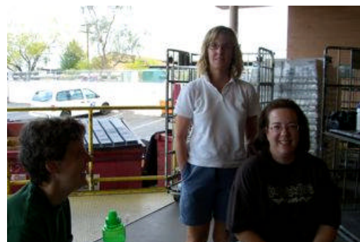
Food Bank Event Volunteers