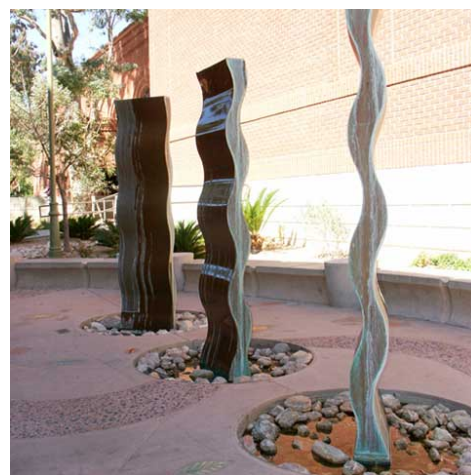
Left, the Woman's Plaza of Honor Arches; right, the Three Muses Fountains at the Plaza.

learn about their foremothers, and the women who paved their way to expanded opportunities.