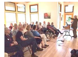
Homestead Villagers and friends - Healthy Heart, Healthy Brain