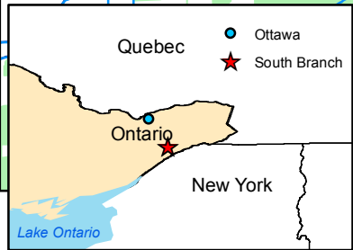
Key Map to Project Area