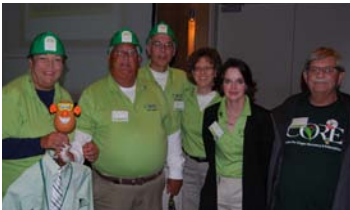
CORE Erie Volunteers with the CORE Spirit Stick!