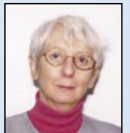
Maureen Crudge Governor - Ellesmere Port & Neston