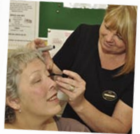
A member of staff gets the relaxing treatment

T he Breast Care Nursing Team recently held their annual pamper day – now in its 5th year and still as popular as ever with our patients.