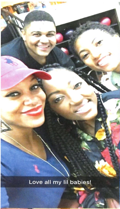
Love all my lil babies!