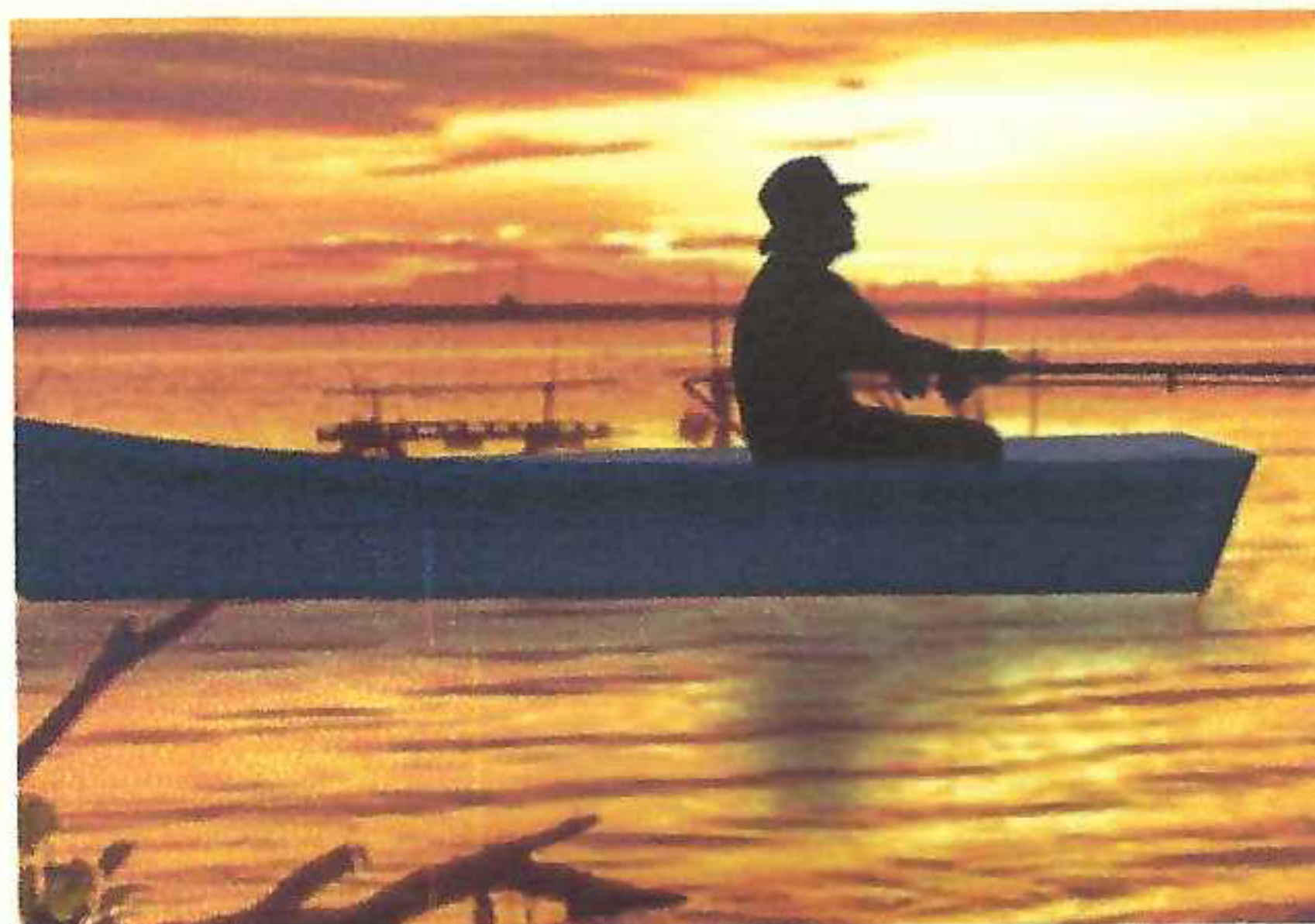
A True Fisherman

A true fisherman knows when and where the fish are biting. He rises up early in the morning, plying the water for that elusive catch, waiting in the stillness for a nibble. A slight twitch in the line, expertly he reels it in. A good fisherman knows a keeper when he sees one, he knows when to toss one back, and when to head for home.