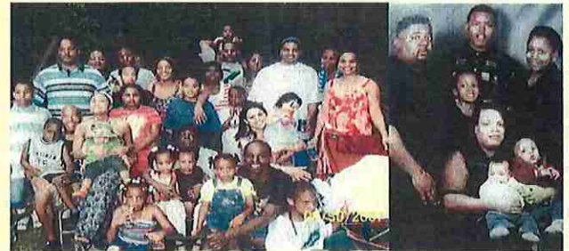
The Webb, Watson, Johnson and Gonzalez Grandchildren

Our hearts never felt so much pain, The sky came together and dropped a lot of rain; We thought our life was coming to an end, All we know is we will never give in. You're the reason we became who we are, You held our life in the palm of your hand. You showed us right from wrong, But the day you died, everything went wrong. You knew us, oh so well, the day you died, our heart fell. We will never forget you until we die, maybe some day we'll meet in the sky. We know the Lord took you cause it was time, But He should have let us say the right goodbye. We think of you from day to day, wondering what you'd think of us today.