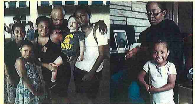
The Clark Grandchildren