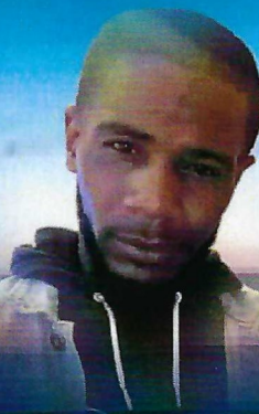
Sunset March 16, 2023

Service: Friday March 31, 2023 12:00 p.m. at Change Church 200 Ludlow Drive Ewing, NJ 08638