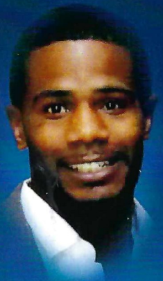
Sunrise March 30, 1993