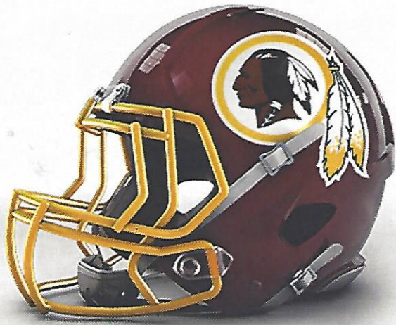
A Diehard Redskins/Commanders Fan