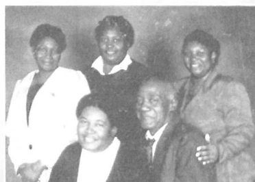
Your loving family