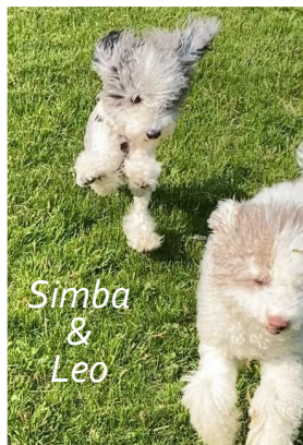
Simba & Leo