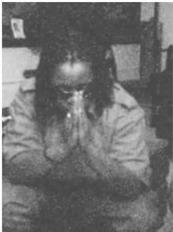
A Woman in Prayer

When a woman seeks God, she transforms the air; more precious than a ruby is a woman in prayer.