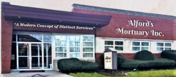
1222 Napier Street • South Bend, Indiana 46601

Phone: [574] 282-2477 Fax: [574] 282-2492 Email: alfordsmortuary@att.net Website: www.alfordsmortuaryinc.com