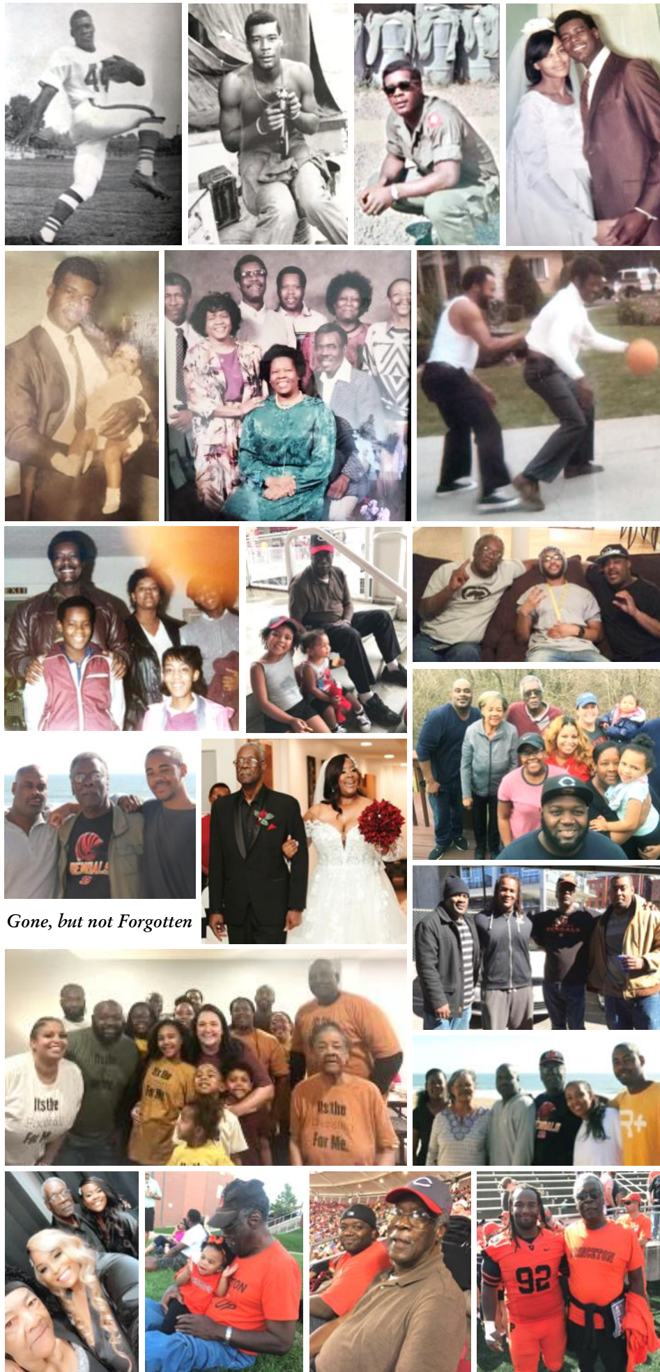
Gone, but not Forgotten