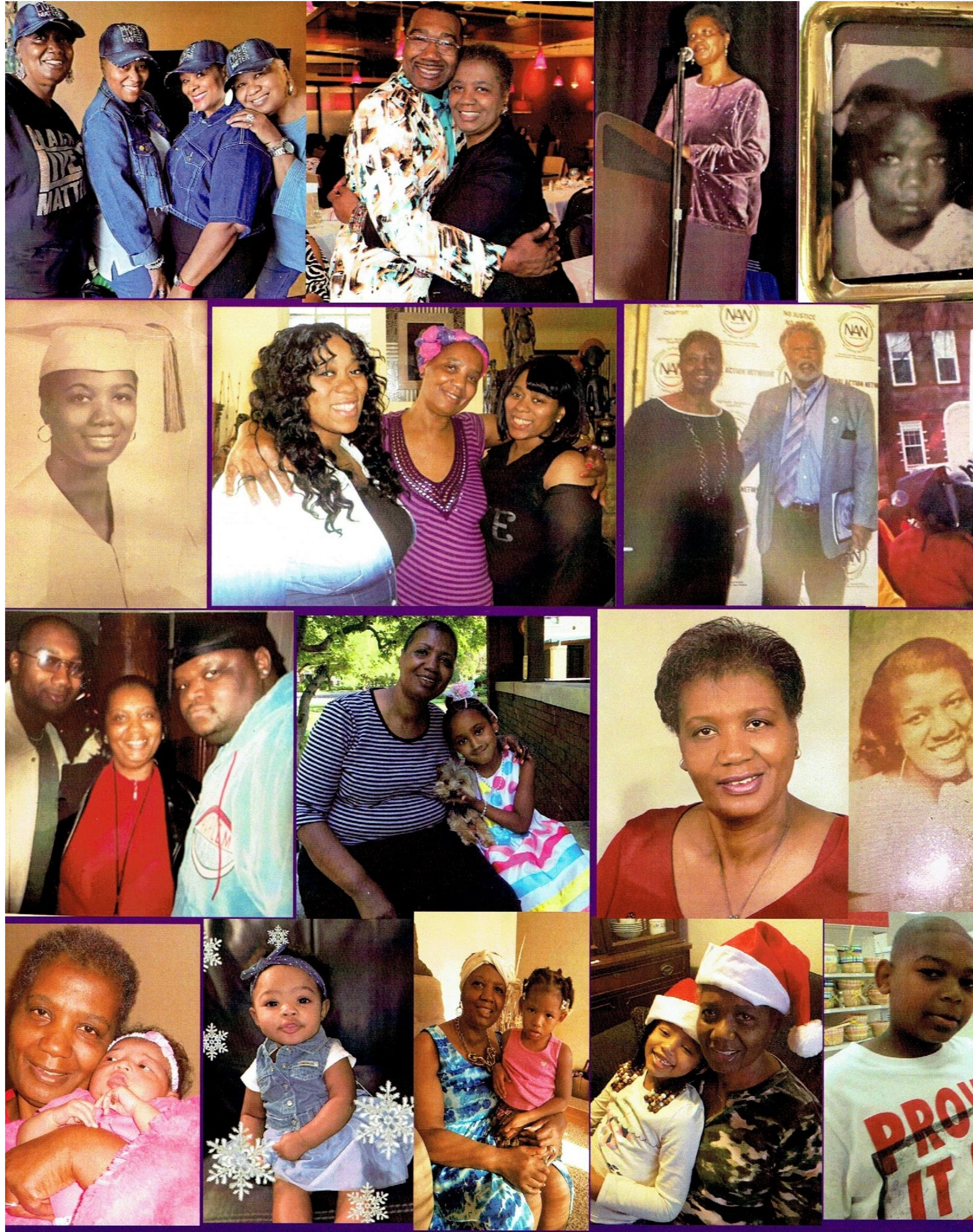
Mother - Sister - Friend