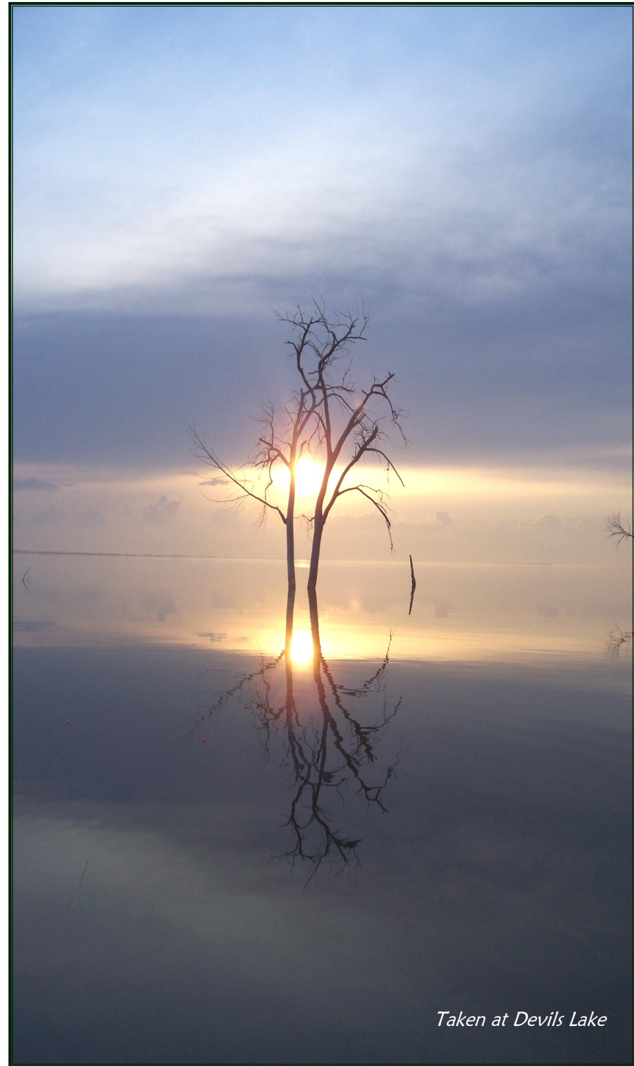
Taken at Devils Lake