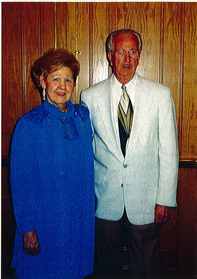
50th Wedding Anniversary