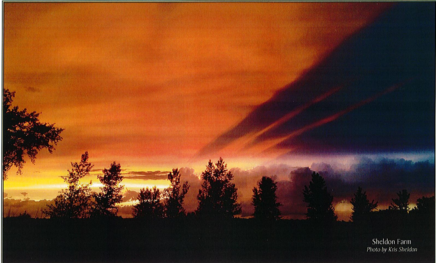
Sheldon Farm