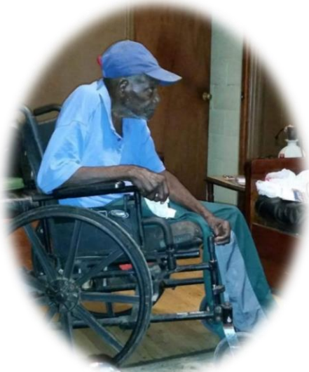
The Day God Took You Home

You never said "I'm, leaving," you never said good-bye, You were gone before we knew it, and only God knew why. A million times we needed you, a million times we cried, If love alone could have saved you, you never would have died. In life we loved you dearly, in death we love you still, In our hearts you hold a place, that no one could ever fill. It broke our hearts to lose you, but didn't go alone. For part of me went with you The day God took you home.