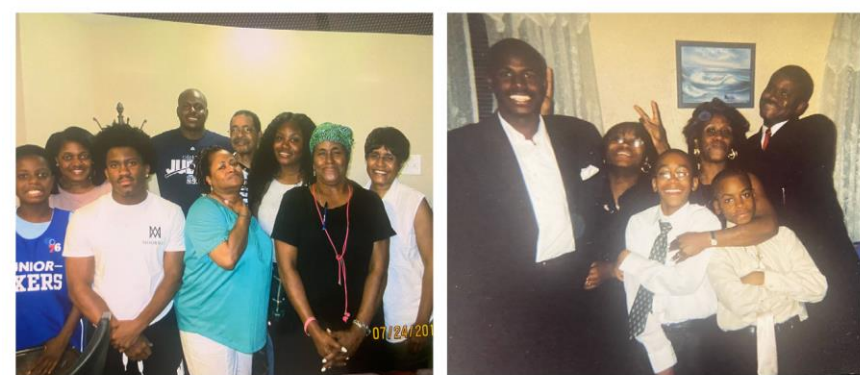
PALLBEARERS Family and Friends